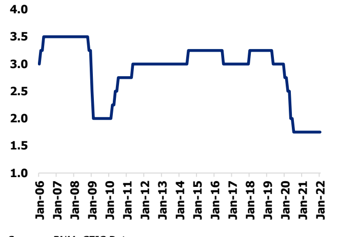
Chart 2: OPR (%)

Sources: Department of Statistics Malaysia (DOSM), CEIC Data